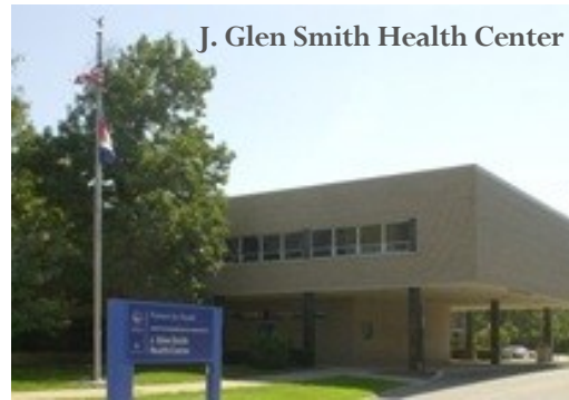
J. Glen Smith Health Center

CenterPoint, a program of the City of Cleveland Department of Public Health's Office of Mental Health and Substance Abuse, is certified by the Ohio Department of Alcohol and Drug Addiction Services (ODADAS) and is a contract provider of the Alcohol, Drug Addiction and Mental Health Services (ADAMHS) Board of Cuyahoga County.