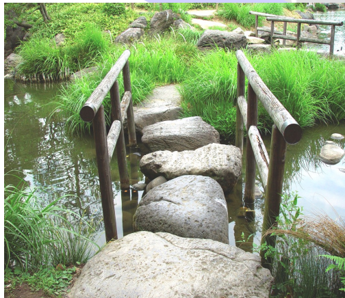
Taking Steps Towards Healthy Lifestyles.